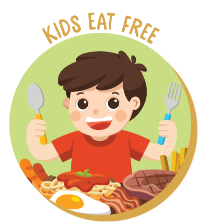
Join us Fridays 5 pm to 9 pm, kids 10 and under eat FREE! Ask us about the details.