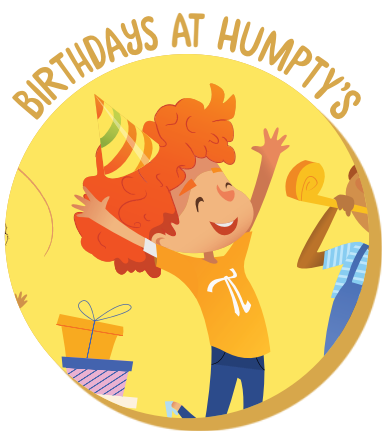
Celebrate with us on your birthday and enjoy a Happy Birthday Entrée and drink or a kid's sundae absolutely FREE!