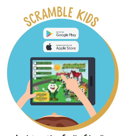
An interactive family friendly game designed just for you. Download the app today!