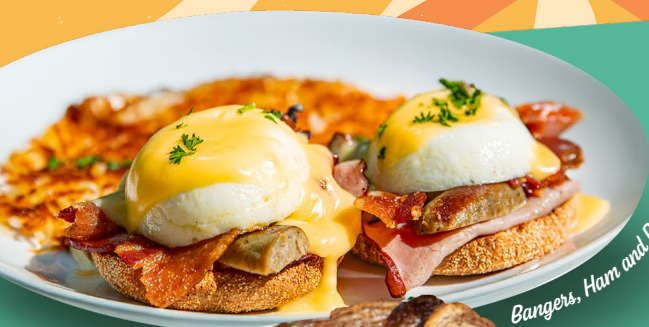
Bangers, Ham and Bacon Benny