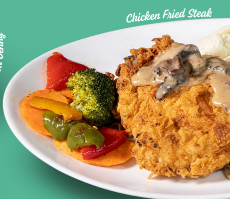
Chicken Fried Steak