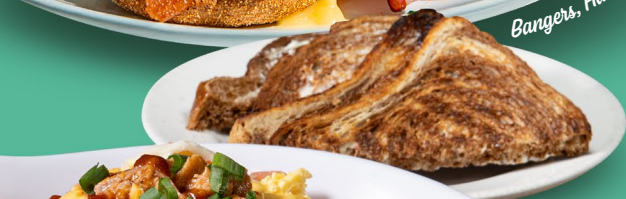
Pulled Pork Pan Scrambler